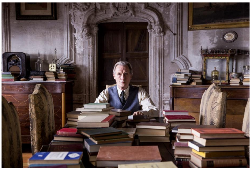
Speelduur: 113 min. - Land: UK - Jaar: 2017 - Genre: Drama

THE BOOKSHOP won de 'Prijs voor Beste Boekverfilming van het jaar' op de Frankfurter Bookfair.